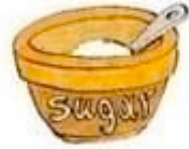
a bowl of sugar