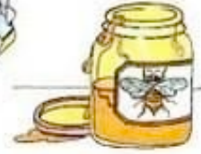
a jar of honey