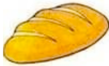
a loaf of bread