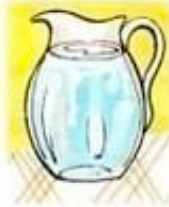
a jug of water