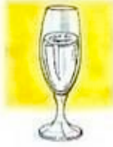
a glass of water