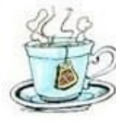
a cup of tea