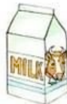
a carton of milk