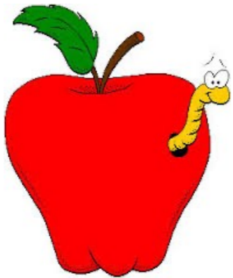
in the apple

The cans are in the box. The fish is in the bowl. The worm is in the apple. The men are in the pool.