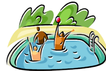
in the pool