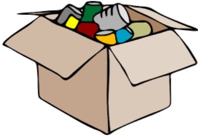
in the box

We use “in” for something that is inside.