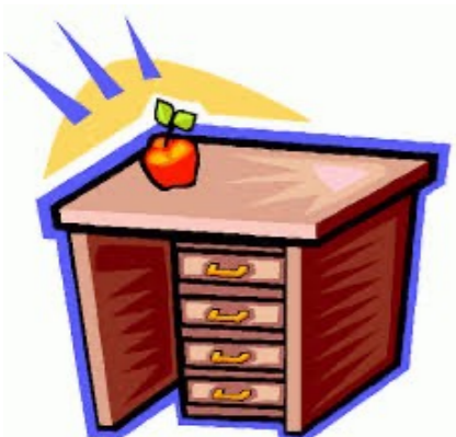
on the desk