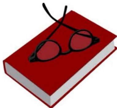
on the book