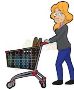
at the store