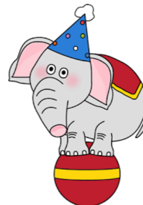
on the ball