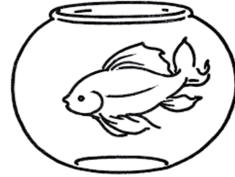
in the bowl

The cans are in the box. The fish is in the bowl. The worm is in the apple. The men are in the pool.