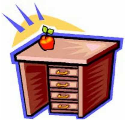
on the desk

We use “on” for something that is at the top.