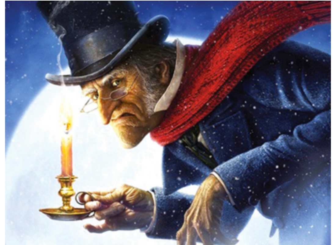
Scrooge hates Christmas