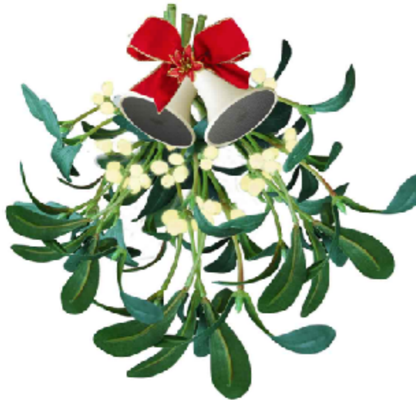
mistletoe: you have to kiss if you are caught under the mistletoe