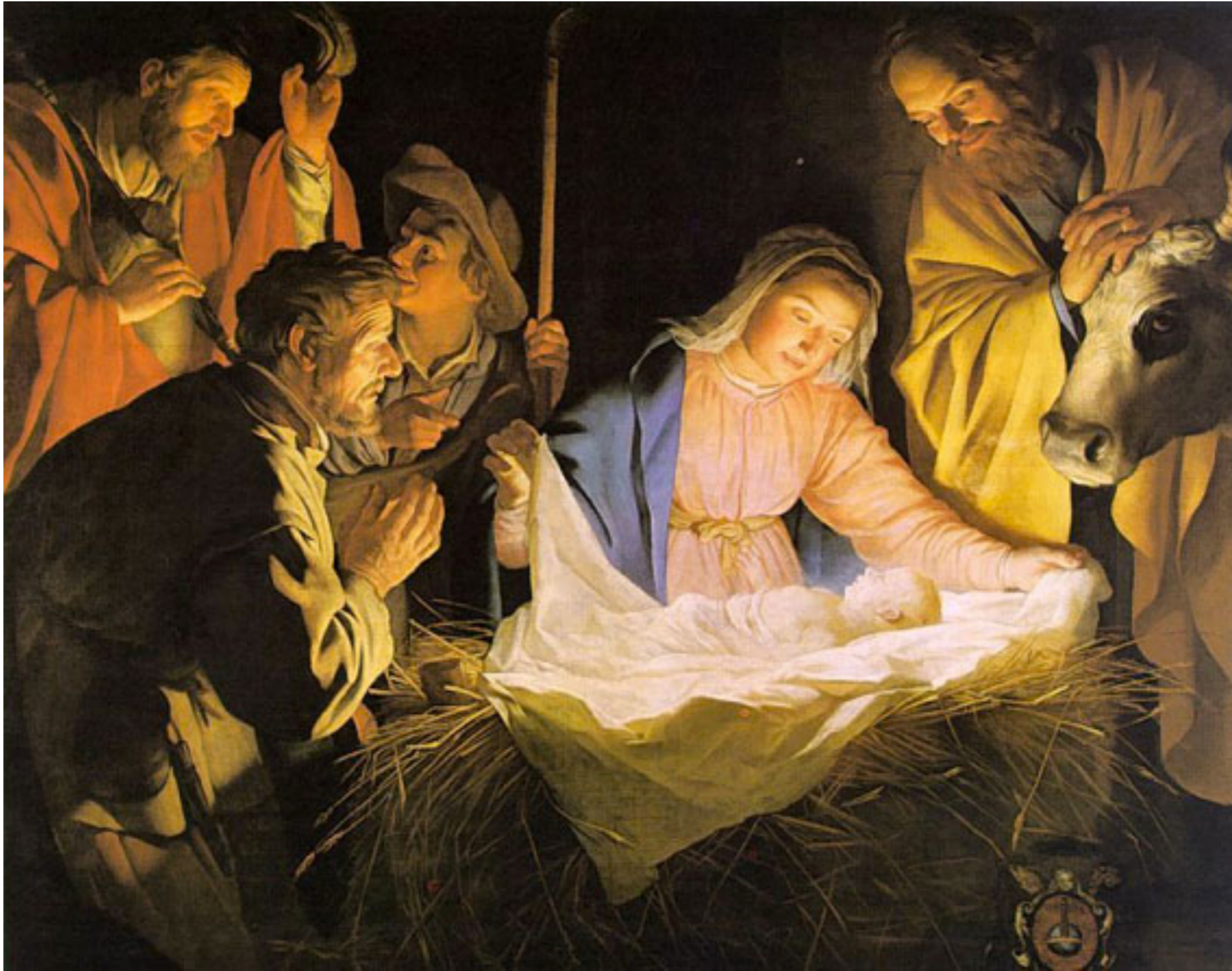
Shepherds visit baby Jesus.