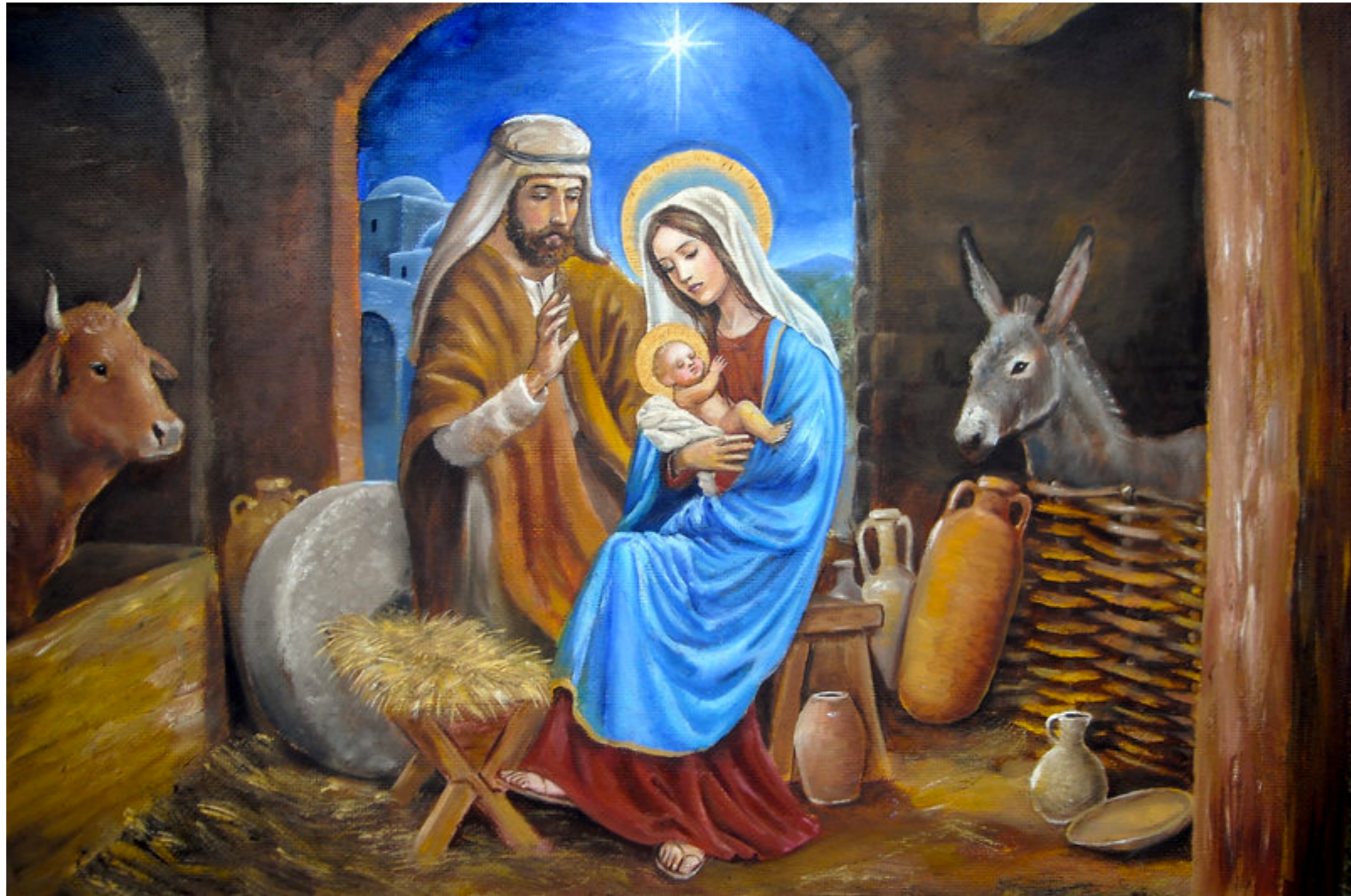
Jesus is born in a stable. An ox and an ass are there. A star hovers over the stable.