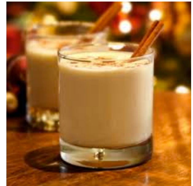
eggnog: made with eggs, cream and rum