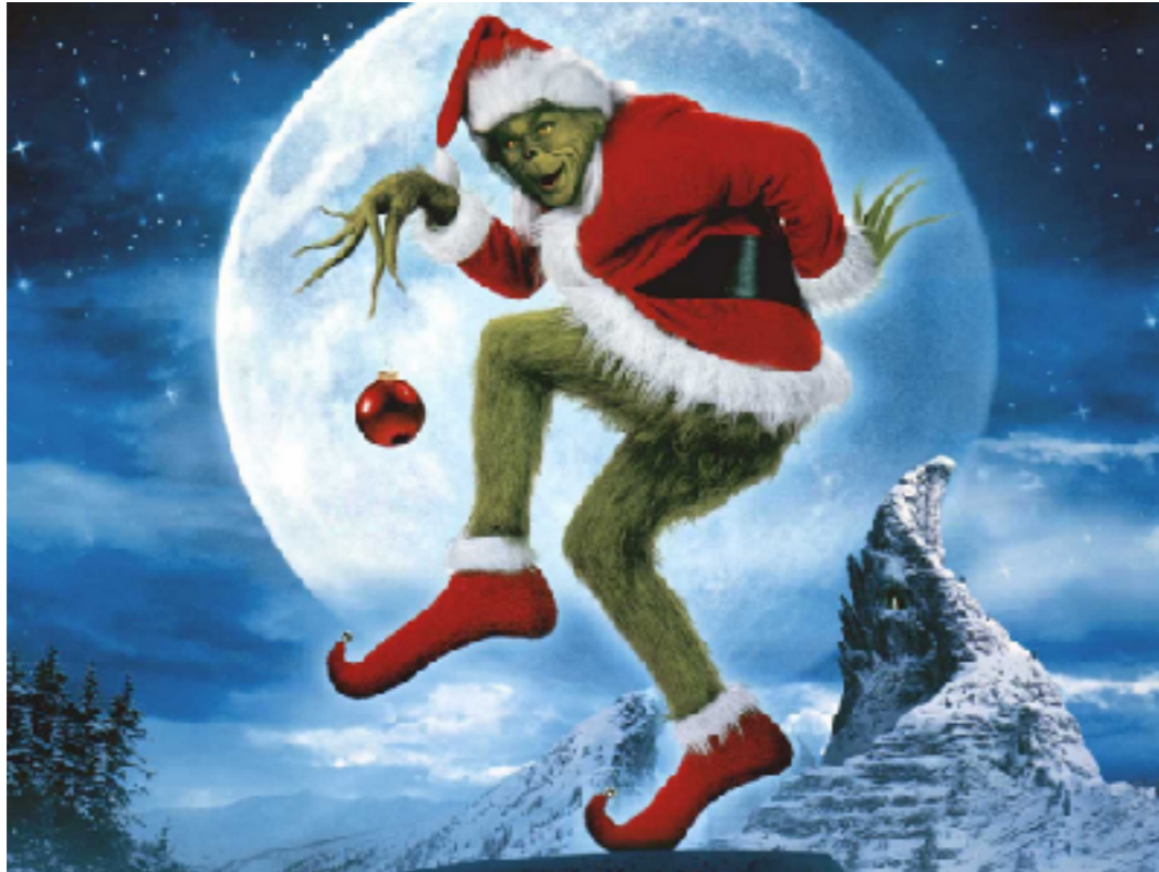
Grinch who stole Christmas

These guys are greedy misers. They stand for the opposite of what Christmas is about.