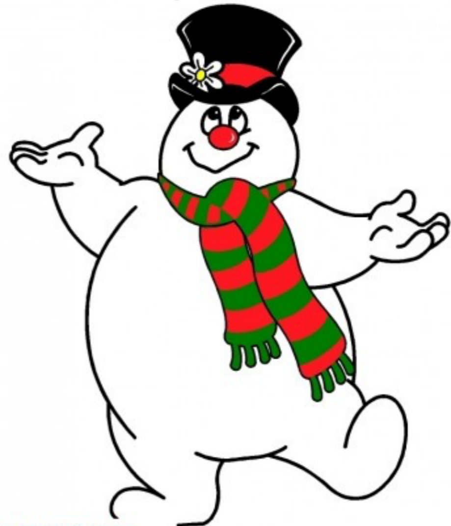
Frosty the Snowman